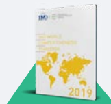
World Competitiveness Yearbook Report