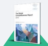
Global Competitiveness Report