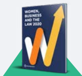
Women, Business and the Law 2020