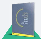
Reports assigned to government entities