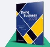
Doing Business Report